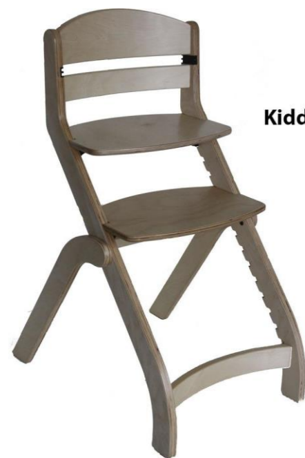
Kiddo childrens chair